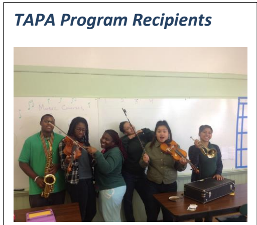
TAPA Program Recipients

We continue to advertise our need for usable musical instruments with some success. We have been able to collect Clarinets, Flutes, a Saxophone, Trombones, Trumpets, Violins, Guitars and amps and a Cello. Some of the instruments are not serviceable but all donations are accepted, acknowledged and reviewed. A lengthy list of instrument requests was received by the Warwick School System, Providence Schools and TAPA. We are in the process of assessing our inventory and making a determination on what requests we are able to fill.